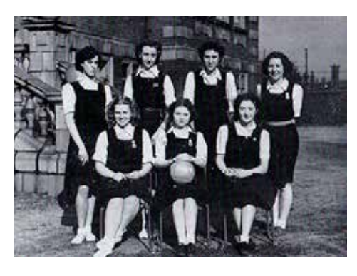
Did you play netball at school? Have you lost touch with the game over the years? Right across Scotland there is a