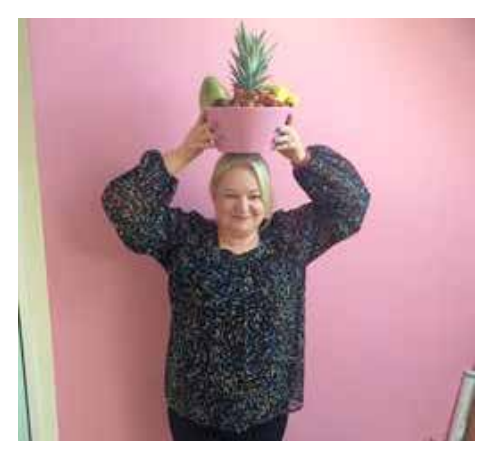
Breast Cancer Now are invested in promoting healthy lifestyles for women as a preventative approach to reduce the risk of developing breast cancer. The Edinburgh Office of Breast